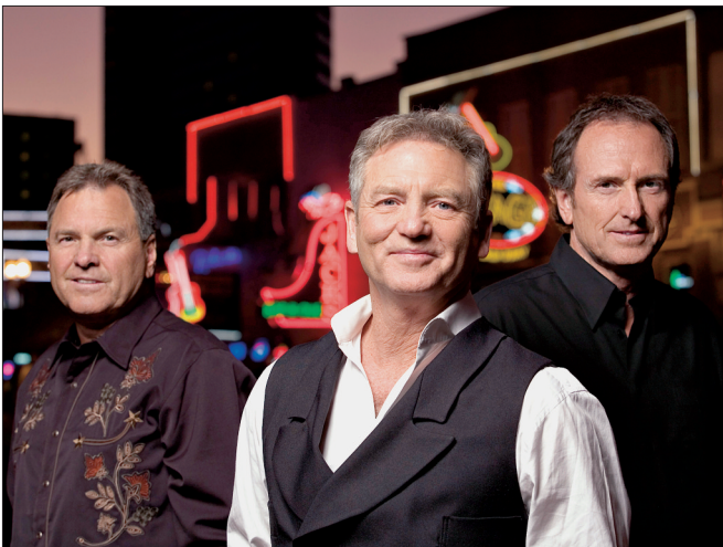
Larry Gatlin and the Gatlin Brothers